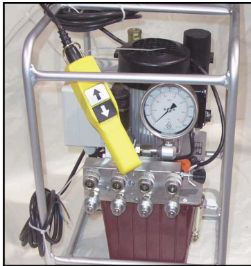
TITAN Express Auto Electric 115V or 230V Automatic Cycling Model EXE-4-AUTO