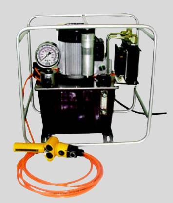
EXE 2000TT Electric Tensioner Pumps