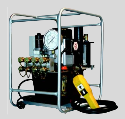
Titan Hydraulic Torque Wrench Pumps including the revolutionary SmartTite Autocycle Torque Wrench System

TITAN is a leading bolting solutions provider committed to offering the most reliable and comprehensive bolting solutions world wide.