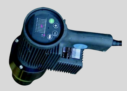
Titan ETite Electric Torque Wrenches Plus Series Torque & Angle