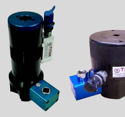
High Load Single Piston & Double Stacked Tensioners for 10.9 proof load requirement ASTM A490M and EN ISO 898 1:1999