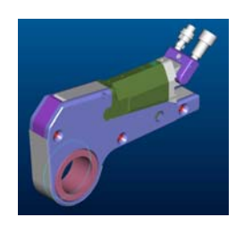
Contact your local Titan Representative for a demonstration