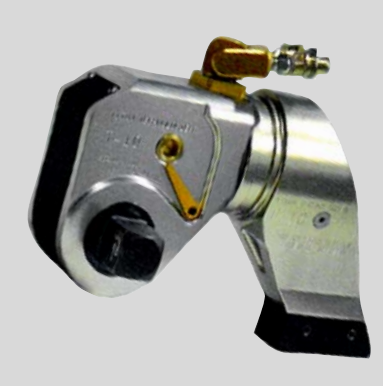
Titan Hydraulic Torque Wrenches