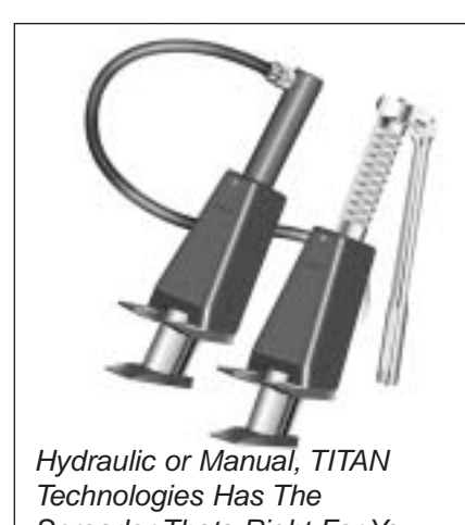
Spreader Thats Right For You.