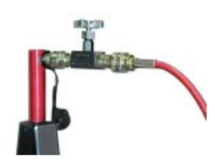
HS10K with HSCV Isolation Valve.