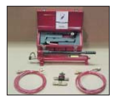
All flange spreaders are conveniently packed in a custom tool box.