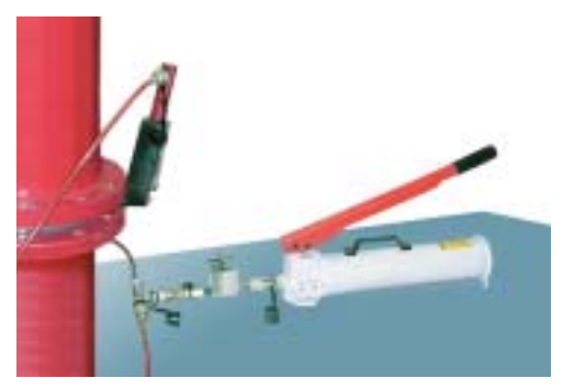
A 100H2 Hand Pump Operating a Pair Of HS10K's.

HS10K Hydraulic Flange Spreaders May Be Used In Multiple Units Connected To a Common Hand Pump. A Load Lowering Value As Shown Controls The Rate Of Travel. The Optional Isolation Valves Enable The Operator To Control Each Power-Spreader