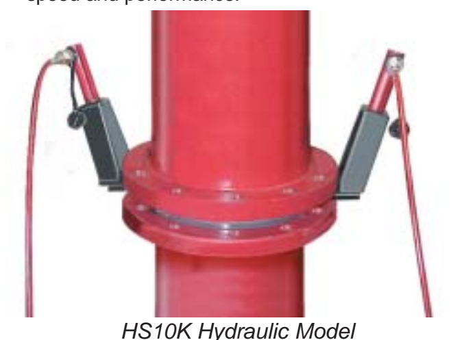
• Universal: One Size Fits All

HS10K: With the Hydraulic Power-Spreader<sup>™</sup>, a hydraulic cylinder replaces the ratchet handle. Power 1 or multiple Power-Spreaders<sup>™</sup> easily using a standard hand pump. A pair of Power - Spreaders<sup>™</sup> supply 20,000 lbs. of spreading force and 3" of travel; ample for gasket replacement or turning of blinds. Use a TITAN® power unit for best speed and performance.