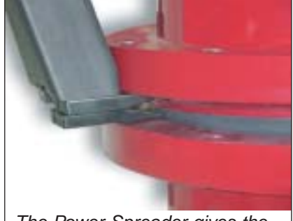
The Power-Spreader gives the operator up to 3" of travel in one operation!